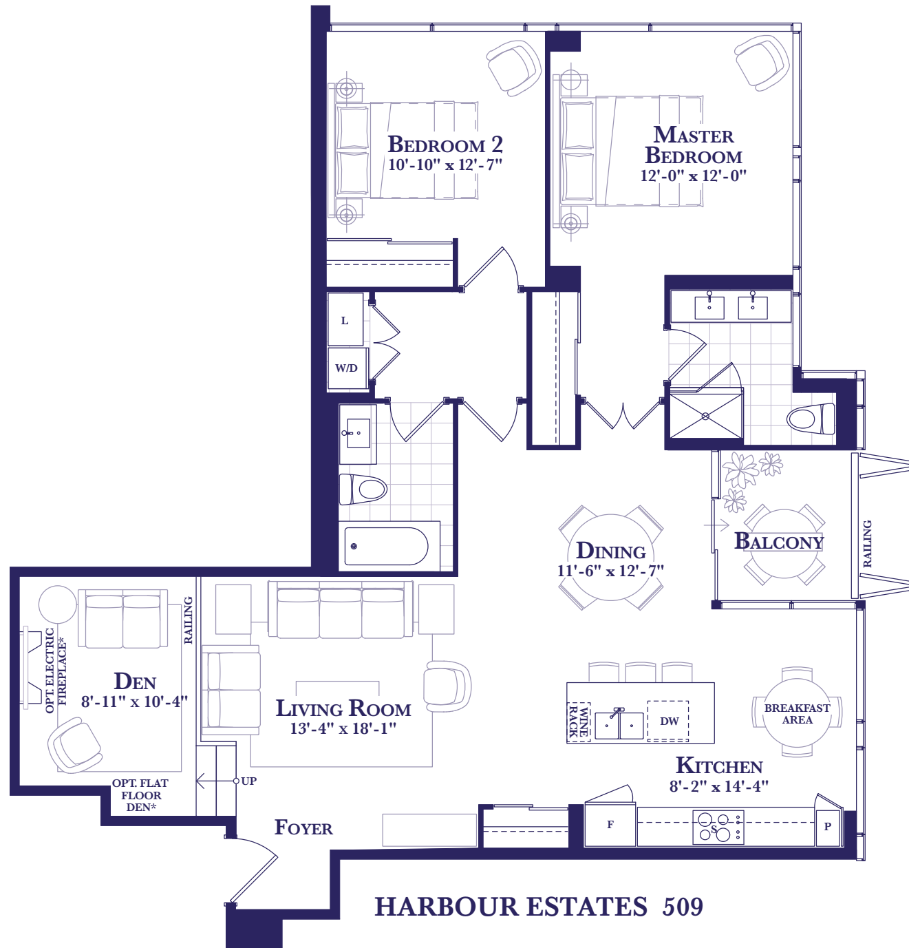
HARBOUR ESTATES 509